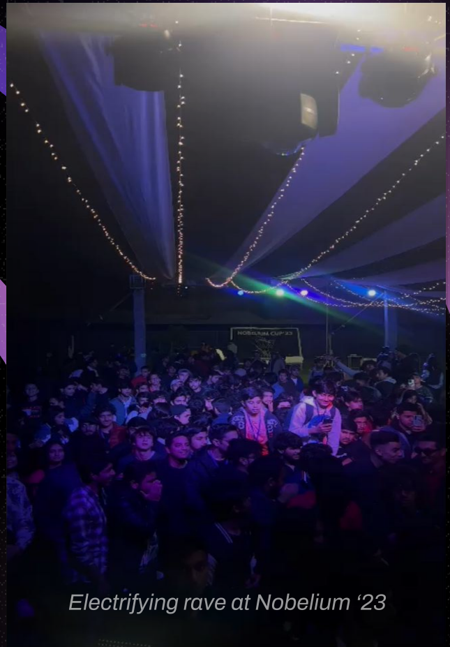
Electrifying rave at Nobelium '23

sports positively. Nobelium is also committed to breaking barriers and promoting women participation in the world of sports.